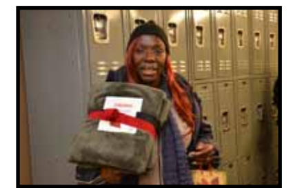
You help touch lives here every day of the year...and especially on Christmas!